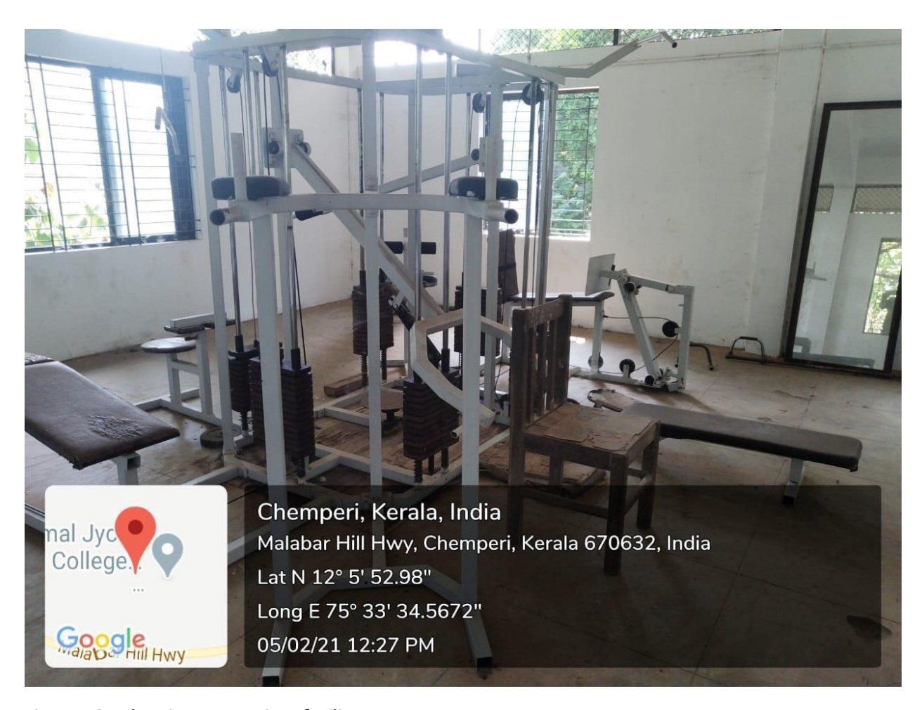
Figure 6&7 showing gymnasium facility