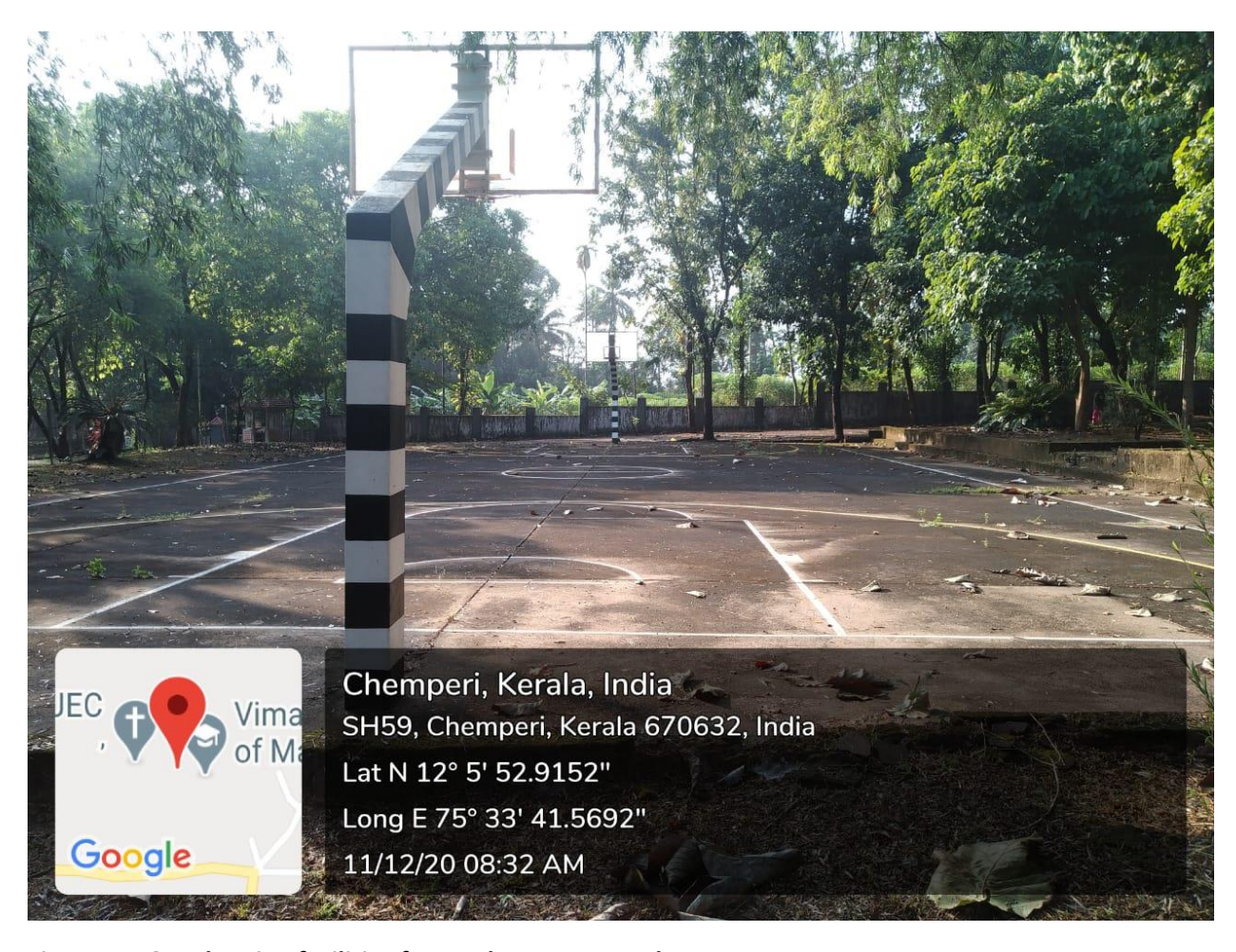
Figure 3,4 & 5 showing facilities for outdoor sports and games.