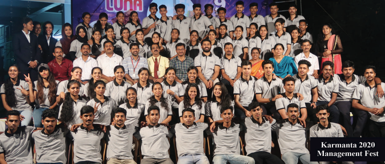
Karmanta 2020 Management Fest