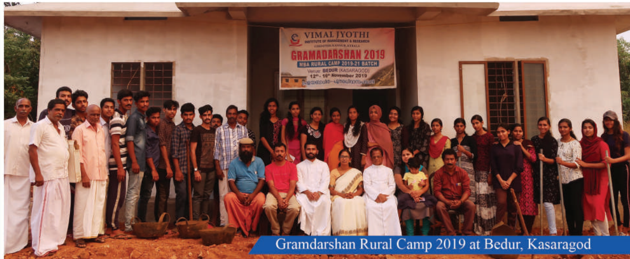
Gramdarshan Rural Camp 2019 at Bedur, Kasaragod