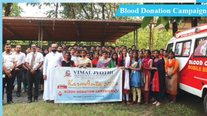
Blood Donation Campaign