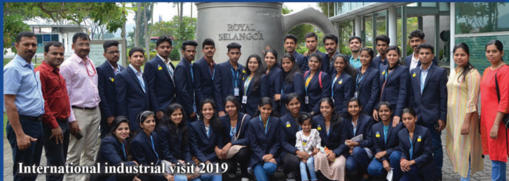
International industrial visit 2019